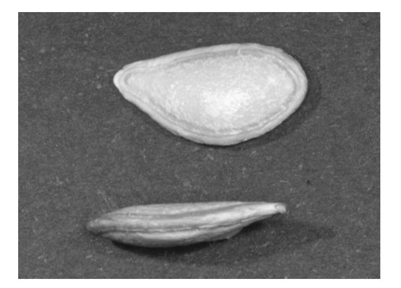
Fig. 1.2 shows two seeds from this fruit.